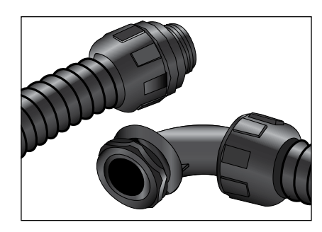
Liquid-Tight Flexible PVC Tubing