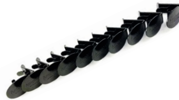
Fig. 4: FLX2-LATCH-10