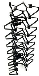
Fig. 1: FLX2-1FT