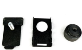
Fig. 2: FLX2-END-CLAMP