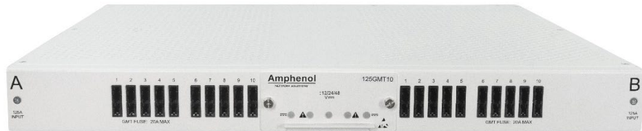
Fig. 1: 125GMT10 Front View

both legacy and “next-gen” network applications. Engineered into a standard 1RU footprint that support up to 20A GMT fuses in each position, providing ample capacity for distribution to a broad range of components. The panel is available in standard terminal block outputs or connectorized outputs.