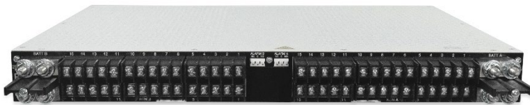
Fig. 2: 125GMT15 Rear View

This platform provides front access to GMT fuses. Also featured are front LED indicators for power/fuse alarms, monitoring status, rear connections for form C relay alarms, and optional nrgSMART connections.