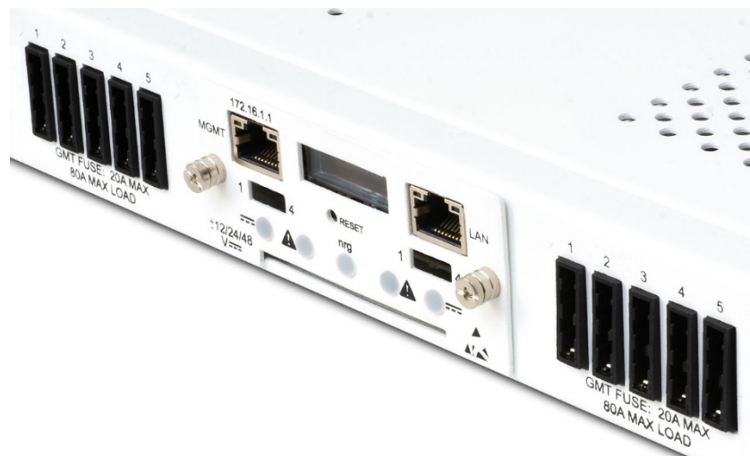
Fig. 4: 125GMT10-CTRL