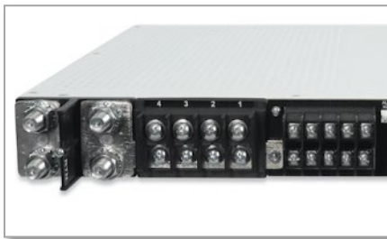
Stud Input/Lug Output