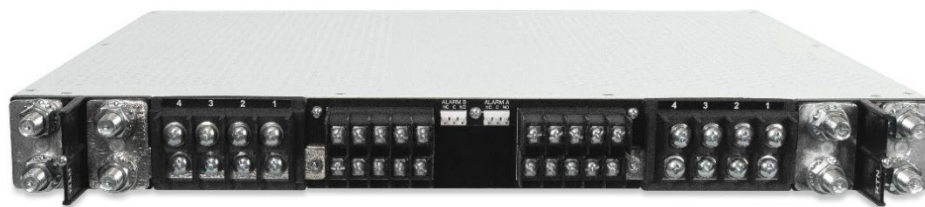
Fig. 2: 240GT54 Rear View

This platform provides front access to alarm enable/disable switch configuration for uninstalled TPA fuse or breaker locations. Also featured are front LED indicators for power/fuse alarms, monitoring status, rear connections for form C relay alarms, and optional nrgSMART connections.