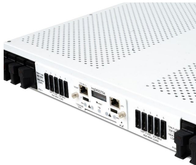
Fig. 4: nrg240GT54-CTRL Front View