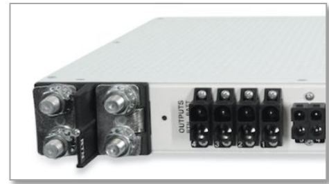
Connectorized/Stud Input "-SC"