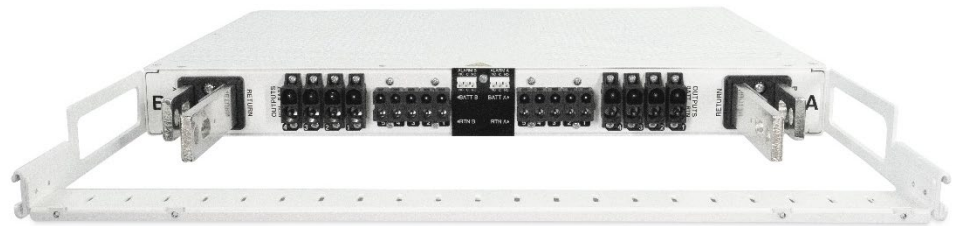
Fig. 3: 240GT54-C Rear View