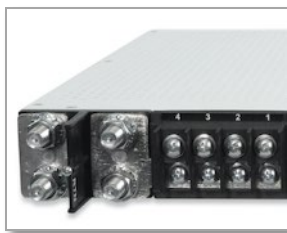
Stud Input/Lug Output