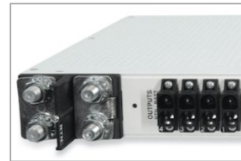
Connectorized/Stud Input "-SC"