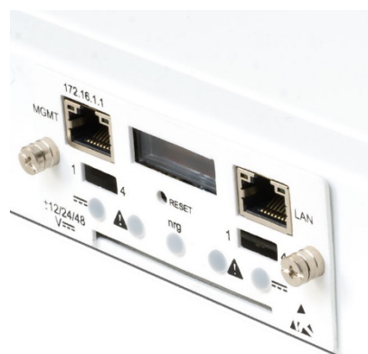
Fig. 4: nrg300CB08-CTRL