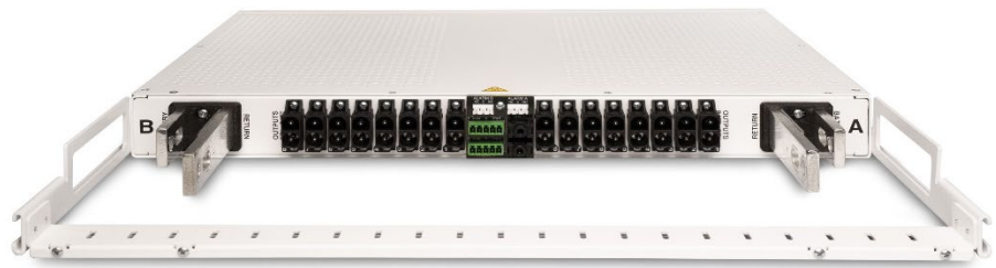
Fig. 3: nrg300CB08-C Rear View