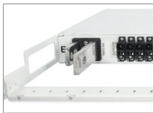
Connectorized/Horizontal Input "-C"