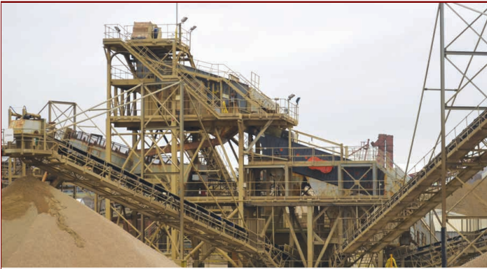
PULP AND PAPER MILLS