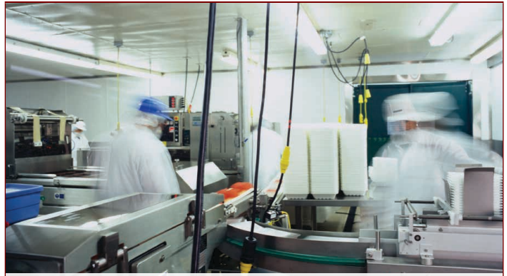
FOOD PROCESSING PLANTS