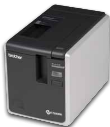
PT-9800PCN Desktop Label Printer (USB, Serial, Host USB, Ethernet)

Images are for illustrative purposes only.