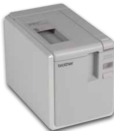
PT-9700PC Desktop Label Printer (USB, Serial)

For more information about Brother P-touch label printing solutions, please contact Brother Mobile Solutions at 1-800-543-6144, or send us an e-mail at mobilesolutions@brother.com .