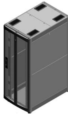
F-Series TeraFrame Gen 3 Cabinet