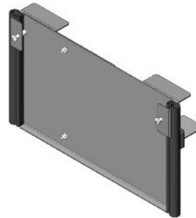
Universal Cabinet End Panel

Note: Floor seal for other cabinets and equipment. Not for use with CPI F-Series TeraFrame or GF-Series GlobalFrame Cabinets.