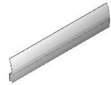
Aisle Containment Exhaust Duct Edge Seal