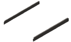
Aisle Containment Cabinet to Floor Side Seal Kit