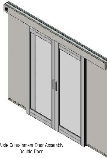
Aisle Containment Door Assembly Double Door