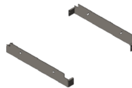
Aisle Containment Cabinet to Floor Front Seal Kit