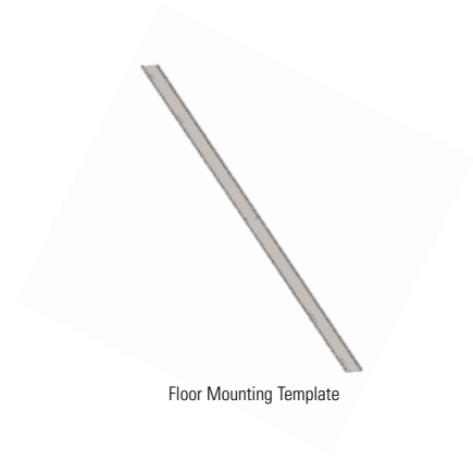
Floor Mounting Template