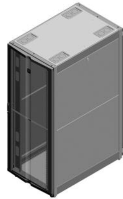
GF-Series GlobalFrame Gen 2 Cabinet