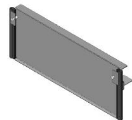
Adjustable Height Filler Panel