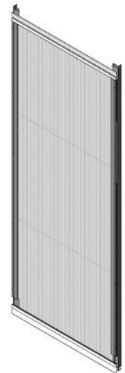
Full Height Blanking Panel