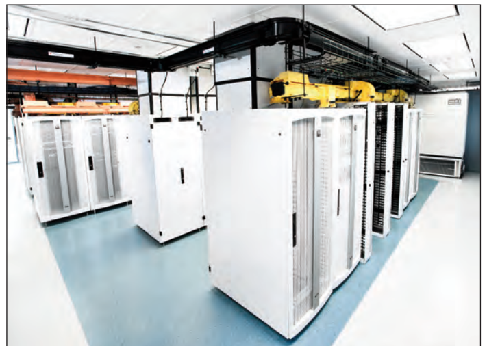
CPI Cabinets and Racks in Orlando Health Data Center

The overall contemporary design greatly contributed to energy efficiency by enabling Orlando Health to reduce their estimated 16 CRAC units to a much