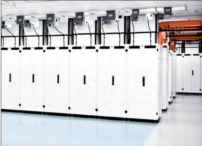
F-Series TeraFrame® Cabinets deploying CPI's Passive Cooling® Solution

“ Healthcare professionals expect systems that are reliable and perform well. An organization must have a robust network infrastructure and a stable computing environment. ”