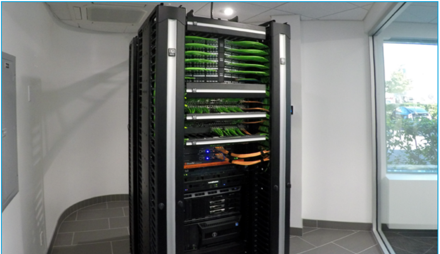
The network is supported by CPI's Four-Post QuadraRack with Evolution Vertical and Horizontal Cable Managers and Universal Cable Runway.