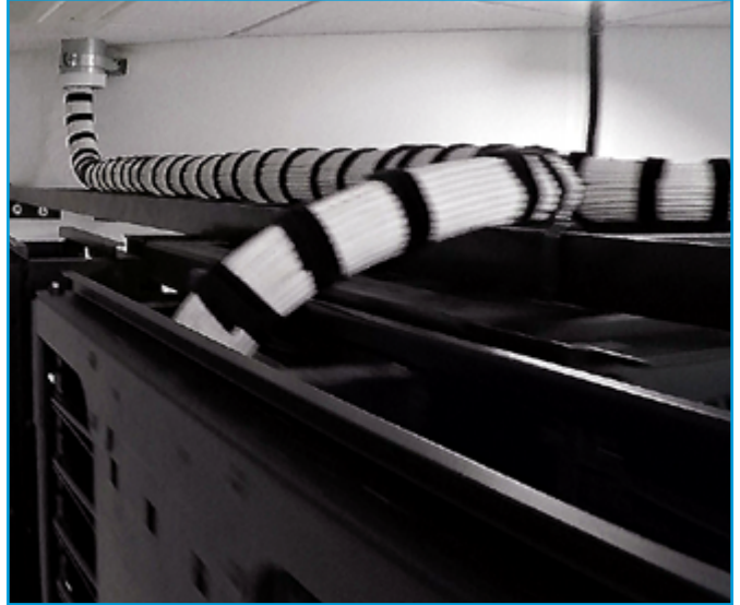
CPI Universal Runway provides reliable support for cables that enter and exit the cable manager.