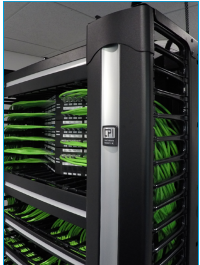
CPI Evolution® Vertical and Horizontal cable managers are a reliable solution for high-density cabling. SCCS has the IT infrastructure support it needs to continue growing its business..

Mann enlisted IT integrator Skyward Technical Solutions for the IT network and integration portion of the project, as well as DIVAD Network Solutions, a contractor specialized in structured cabling, wireless and security systems based in Southern California.