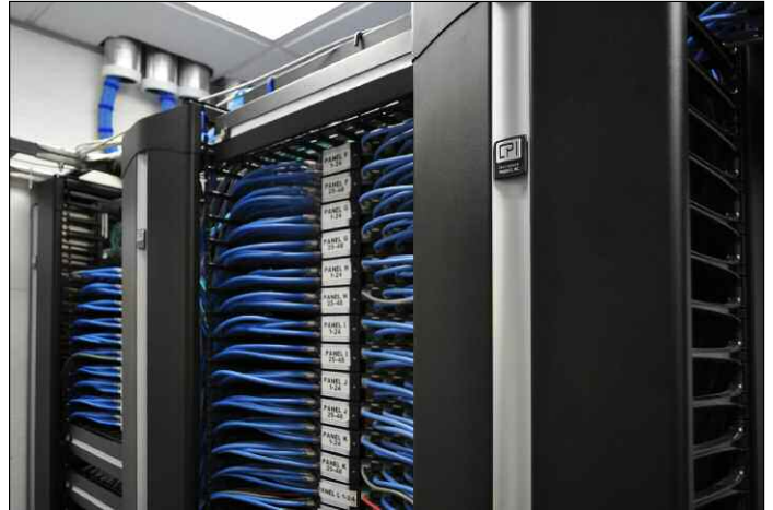
Evolution Cable Management is used in all of Scripps' IDF closets to save time and money on moves, adds and changes.

Scripps Networks also wanted to eliminate hot spots and be able to support up to 30kW per cabinet, as opposed to the current 6kW. The media