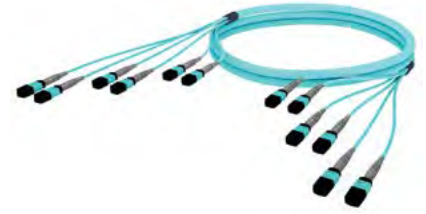
MPO8 multimode UPC trunk cables