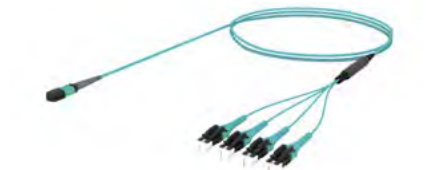
MPO8 multimode UPC array cords