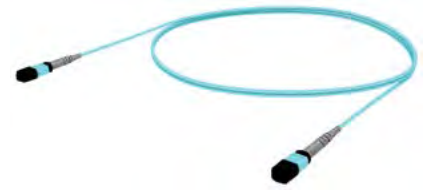
MPO8 multimode UPC patch cords