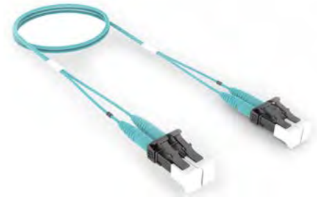
SYSTIMAX fiber-optic LC patch cords