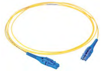
SYSTIMAX LC Uniboot patch cords