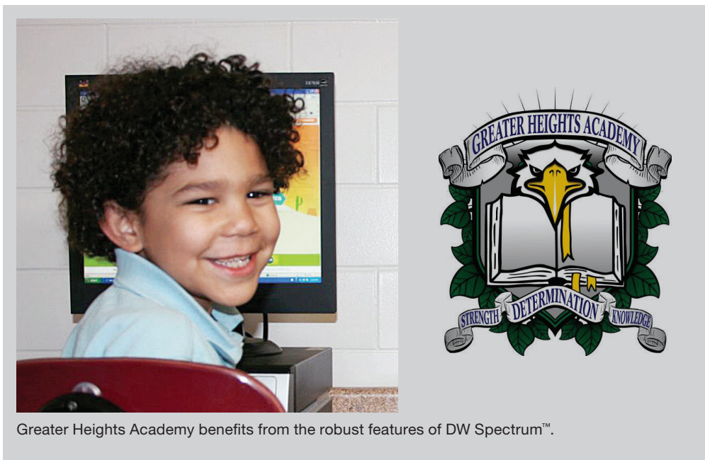
Greater Heights Academy benefits from the robust features of DW Spectrum™.