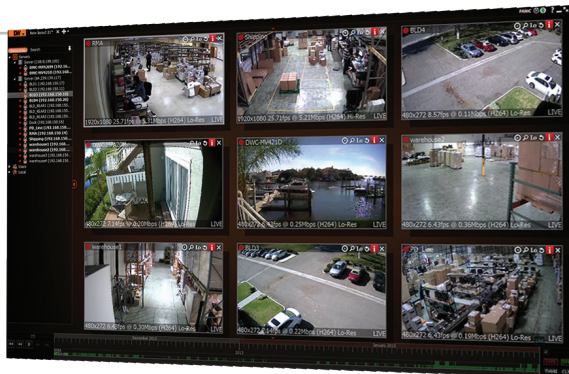
DW Spectrum™ screen view