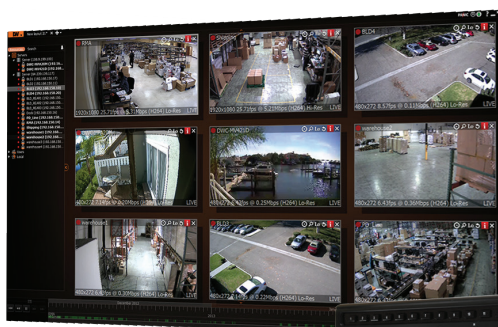
DW Spectrum™ screen view