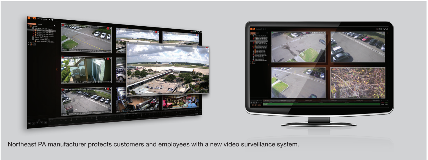
Northeast PA manufacturer protects customers and employees with a new video surveillance system.