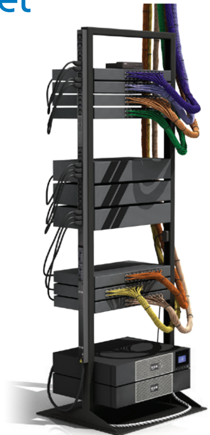
Network Closet Rack

While network closets take on all shapes and sizes, they are essentially an arm of the data center and as an important component of all mission-critical environments, must be organized, protected, and managed efficiently and effectively. IT professionals are charged with keeping the technology infrastructure functioning, even in the face of constrained resources and increasing complexity. By selecting the correct rack and power infrastructure, paired with management hardware and software, organizations can keep their businesses up and running. In this white paper, we go beyond simple how-to advice for keeping IT equipment operational, and discuss how efficiently managing, organizing, and operating network closets saves time, saves money, and avoids risk utilizing the existing space and equipment.