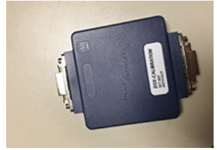
Figure 3 - One of the seventeen copper calibration artifacts as used in our service centers. Encased in plastic shell for protection.

At Fluke Networks authorized service centers, the engineers don't simply test your instruments. If the measurements are off, we also make necessary adjustments or repairs, using genuine service parts. We apply software and firmware updates, test all accessories and replace them if they are defective, clean your tester, and verify its performance. A non-authorized testing lab can only test your instrument and tell you if certain measurements are off-calibration from the standard. But they can't provide the necessary fixes or updates to ensure the level of accuracy you've come to expect from Fluke Networks instruments.