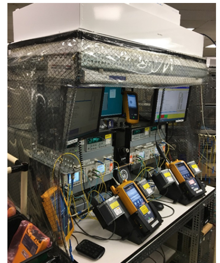
Figure 2 - Fiber calibration station. Note the plastic around the station on the filtration system on top to reduce dust. Some of the commercially available products used are modified by Fluke Networks to meet our accuracy requirements.