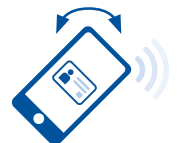
Twist & Go