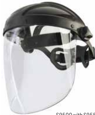
S9500 with S9555 visor