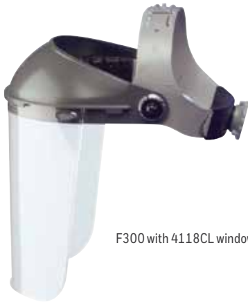
F300 with 4118CL window