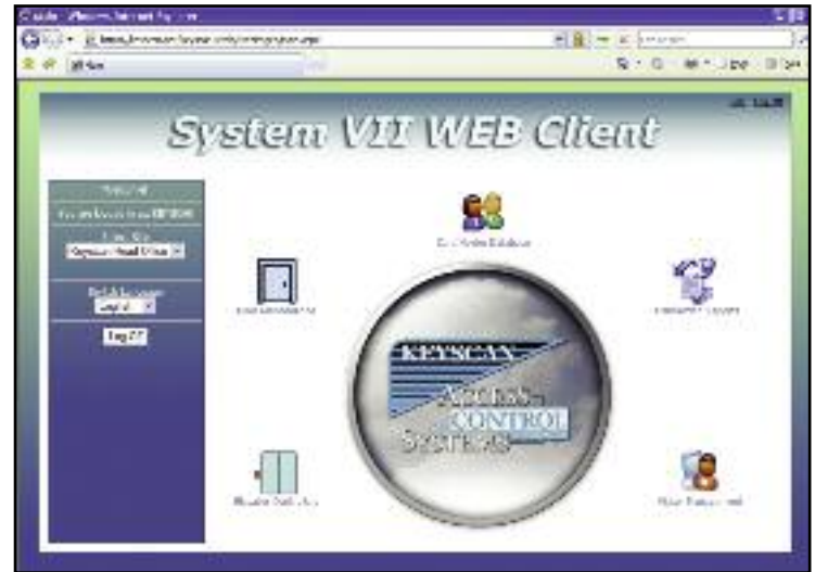
K-WEB Home Page

The power and flexibility of Keyscan Hosted Services and K-WEB module provides organizations the ability to manage their facility's access control systems.