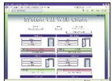
Door status control

Dealers and integrators may choose to create a 'turnkey' offering and provide a one-stop management of their customers access control systems contributing to increased RMR.