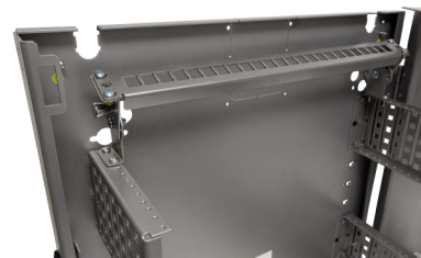
Included Pivoting Panel Mount (Shown Installed) Note: Patch Panel not included

Note: Knock outs shown pre-removed to demonstrate their location. Knock outs will not be pre-removed on shipped cabinet.