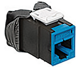
Leviton's Atlas-X1 Premium Copper System is ideal for deployment in all types of mission-critical networks.

Leviton's Atlas-X1 Premium Copper System delivers the highest level of verified performance and reliability and is easily scalable for migrations up to 40GBASE-T. It offers simple tool-free terminations and uses the same termination method from Category 5e to Category 8. Connectors feature interchangeable icons and optional internal shutters for added protection.