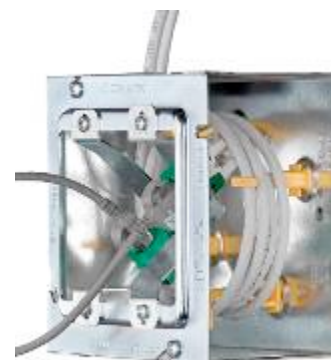
Two In-Wall Brackets