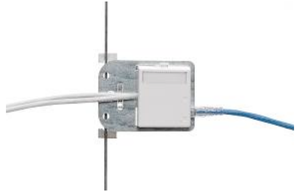
In-Ceiling Bracket with plenum-rated Surface-Mount Box

The QuickPort Brackets, Surface-Mount Boxes and VELCRO Brand products are available through Leviton's extensive distribution network. For assistance ordering plenum-rated patch cords, contact Leviton customer service. Go to the Leviton website for more on QuickPort® In-Wall and In-Ceiling Brackets .