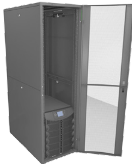
The Liebert APS UPS can be installed on raised floors, traditional flooring, or in rack enclosures.