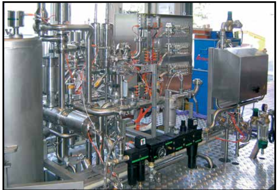
For many businesses, the industrial cord sets and cables used to connect their machinery and systems aren't suited for the extreme conditions created by their plants.

With hundreds of thousands, if not millions, of dollars, as well as the physical well-being of employees and equipment at stake, businesses in industrial settings require cabling components that are built to last, and can be depended upon. In this white paper, we outline the specific challenges connected systems face in these extreme industrial settings, the benefits of new solutions that help maintain uptime, and steps and strategies for finding the best products that meet your unique needs.