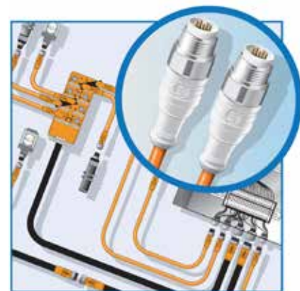
Figure 2. Washdown Connectors Installed