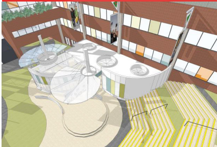
Design view of the atrium from the ground level