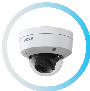
SARIX® ENHANCED High performance with superior visibility and advanced analytics