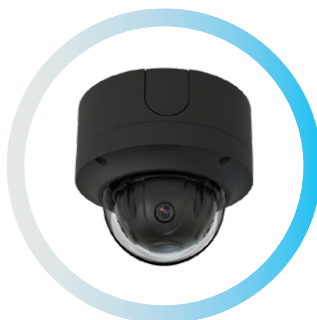
OPTERA® MULTI SENSOR PANORAMIC CAMERA Seamless panoramic view

AEG and Schneider Electric have collaborated for years to design and implement sustainability solutions to boost efficiency, so it's no surprise that they came together again at T-Mobile Arena to create a complete building management system, including the Pelco VideoXpert video management system (VMS) and Pelco IP cameras for video security. Pelco's end-to-end security solution was chosen because it delivers the image quality, functionality and integration capabilities that T-Mobile Arena required in a cost-effective solution.