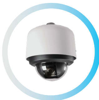
SPECTRA® ENHANCED 7 PTZ IP CAMERA Quick and accurate detection with PTZ