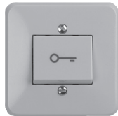
909S/909F 2-7/16" x 2-7/16" (61.5mm x 61.5mm)