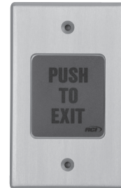
917 4-1/2" x 2-3/4" (114.3mm x 69.9mm)