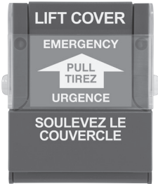
904P 3-9/16" x 4-1/2" (91mm x 114.3mm)