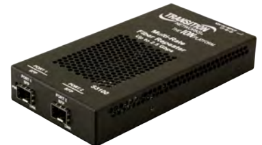
1 GBPS to 11.5 GBPS Fiber SFP to Fiber SFP Stand-Alone Media Converter