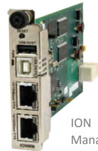
ION Management Module