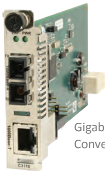
Gigabit Ethernet Media Converter Module