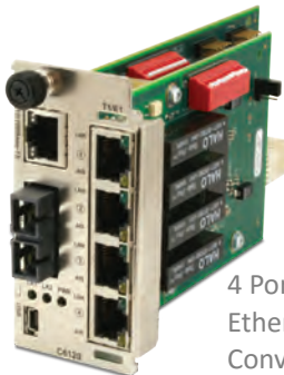
4 Port T1/E1 Plus Ethernet Media Converter Module