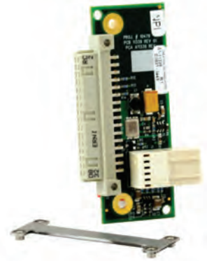
ION Adapter Card

Management modules from both the ION Platform and the Point System™ allow users the ability to re-deploy and fully manage their Point System™ devices, optimizing their current equipment and easing their migration to the ION Platform. Full read/write management of Point System™ modules is also available in the ION chassis through the use of a Point System™ Management Module along with the ION adapter card.