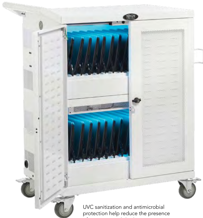
UVC sanitization and antimicrobial protection help reduce the presence of germs on mobile devices.