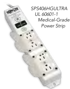
SPS406HGULTRA UL 60601-1 Medical-Grade Power Strip