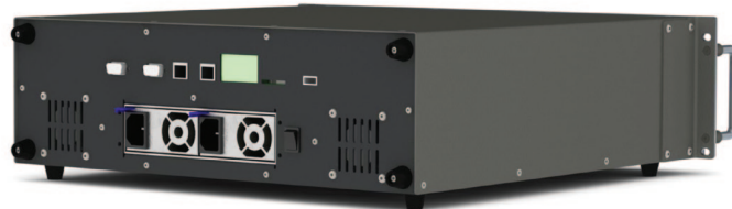
Rear view [above] showing dual Gig-E ports, alarm/relay connections and the dual hot-swap PSU option. Note that the two cooling fans are software controlled and are normally switched off.