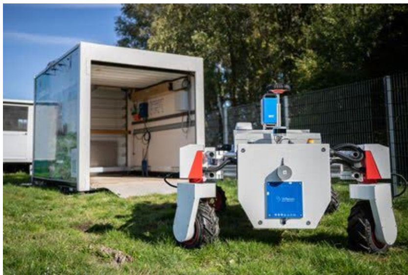
Gut Arenshorst

DFKI has created a mobile sensing platform that consists of a battery-operated robot based on the Saga Robotics Thorvald Platform, named Valdemar, and a base-station container where Valdemar is protected from storms and vandalism while it uploads data and recharges the battery.