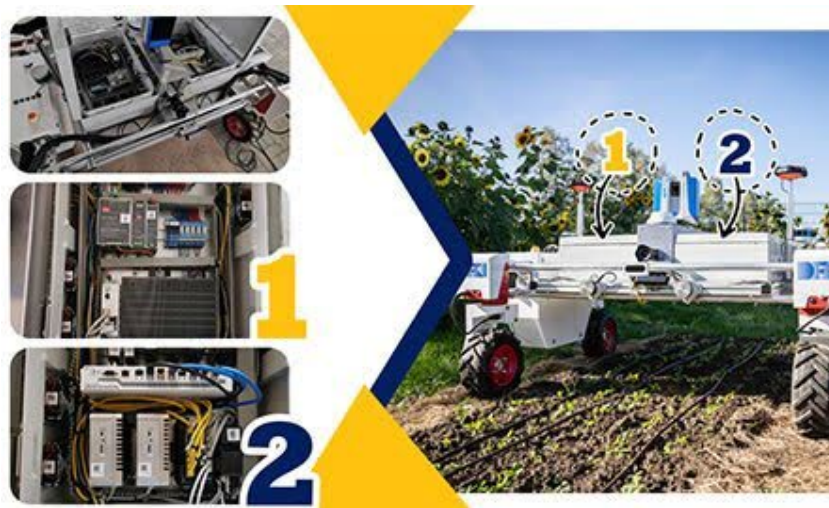
Gut Arenshorst