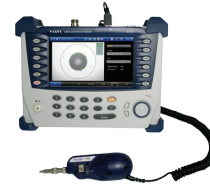
CellAdvisor CAA with P5000i microscope