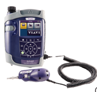
SmartClass Fiber with P5000i microscope