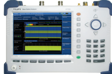
CellAdvisor Base Station Analyzer