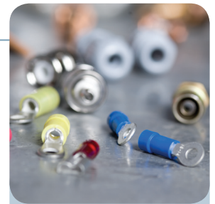
Terminals and Lugs ID and Label Products Tools and Test Equipment Cable Ties and Mounts