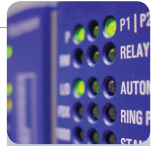
Industrial Ethernet Switches Power Supplies Terminal Blocks Industrial Gateways