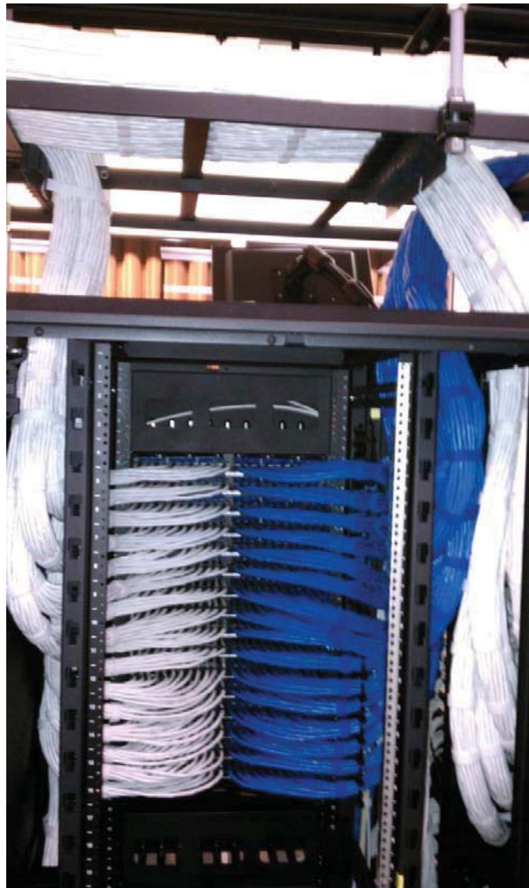
Figure 2. Switch Cabinet Patching Fields

Figure 2 shows the rear view of the patching fields for the switch. 192 cables each in white and blue enter the patching field. Patch cords are used on the reverse side of the cabinet to connect the terminated cables to the switch.