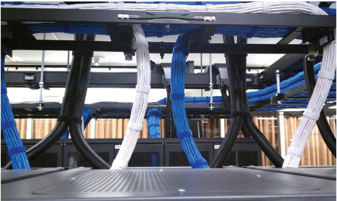
Figure 1. Color-Coded Server Cabinet Cabling Bundles in Panduit World Headquarters

Figure 1 shows color-coded copper cabling bundles leading from server cabinets. In many installations, the cabinet will contain in excess of 40, one RU profile servers. The server-to-switch connections are very often configured for two separate connections, referred to as primary and secondary connections (alternatively main and redundant). In this example, cables associated with the main connection are color-coded blue, and those for the redundant connection are white. Adherence to good labeling practices in the vicinity of the connections to equipment is followed to aid identification of specific cables at a later time. Color-coded hook and loop ties neatly support cable bundles without pinching and potential performance degradations associated with often used nylon cable ties. These cables will be connected to the patching fields for the servers within the cabinet.