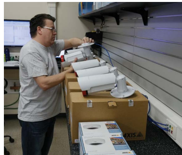
Set up and configuration