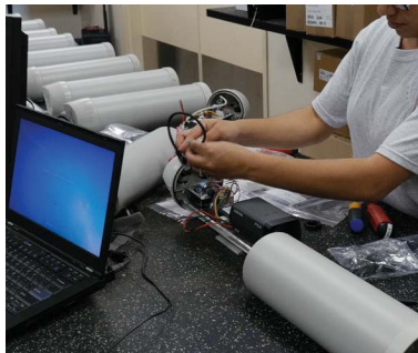
Camera component assembly