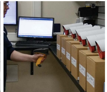
Serial number capture