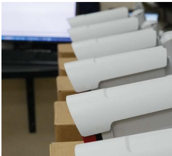
IP address configuration