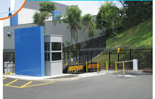
Impasse II is the best choice for securing at risk facilities or protecting specific assets within a property.

What makes Impasse II security fence panels superior is its bracketless design, heavier posts and redesigned rail, that doubles as a secure raceway, which allows even easier integration with intrusion detection systems, closed circuit video and other surveillance and monitoring devices, making it perfect for a data center application.