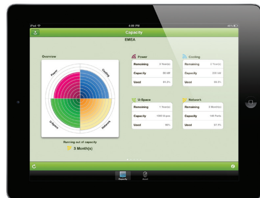
Overview of key data center capacity displayed on a tablet.

> FOR MORE DETAILS VISIT ANIXTER.COM/SHOPAPC