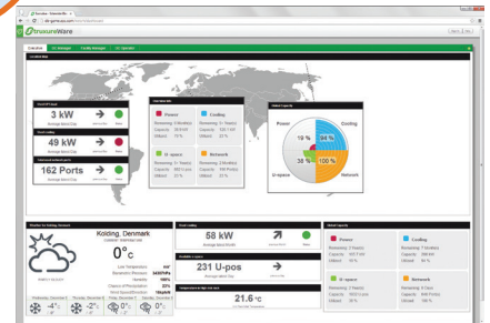
Live overview of data center operations using widgets and data sets.

From managing complex IT Networks to cutting enterprisewide energy and operating costs, you face daily data center challenges. Now, get the most from your data center and simplify operations with APC by Schneider Electric's StruxureWare for Data Centers software. It's an advanced data center infrastructure management (DCIM) suite that gives you the end-to-end visibility you need to optimize, operate and manage your data center from rack to row to room to building.