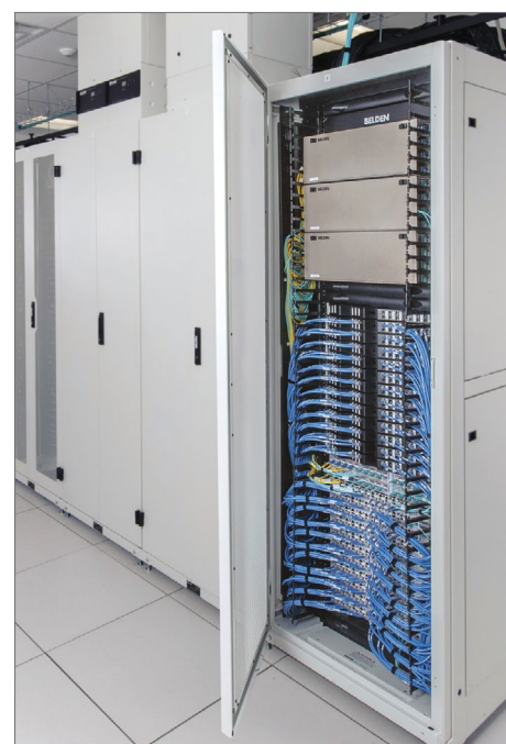
KeyConnect support optimises space in mixed media environments

> FOR MORE DETAILS VISIT ANIXTER.COM/SHOPBELDEN/APAC