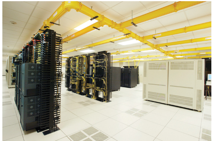
Available in two colours, black and yellow

> FOR MORE DETAILS VISIT ANIXTER.COM/SHOPCOMMSCOPE/APAC