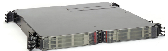
Available in a slim, single rack unit (1RU) form factor.

CommScope's QHDEP is a 1RU (1.75 in.) fibre optic connector panel with six technician-friendly access trays. It is part of the end-to-end Quareo physical layer management system that uses CPID technology. Each tray features a mounting location for holding one LC or MPO adapter pack or one MPO module or cabled module. A single access tray can serve up to 24 LC fibre connections or 8 MPO fibre connections. At full capacity, the QHDEP panel will hold up to 144 LC or 48 MPO fibre connections.