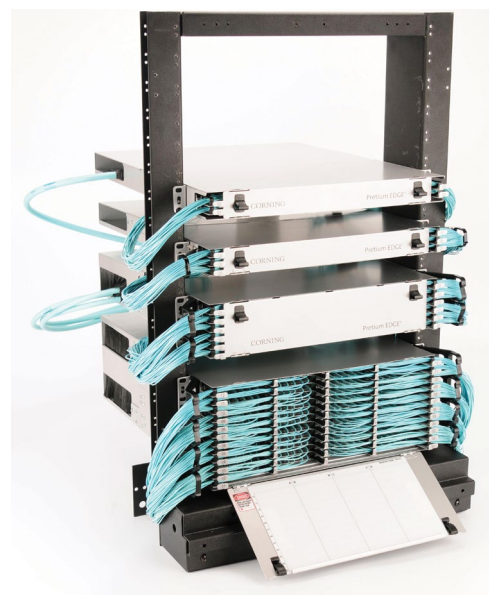
LANscape® Pretium EDGE® solution

> FOR MORE DETAILS VISIT ANIXTER.COM/SHOPCORNING/APAC