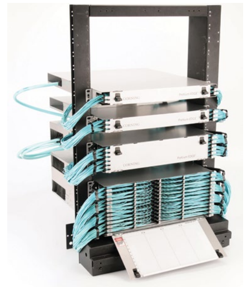
LANscape Pretium EDGE solution

> FOR MORE DETAILS VISIT ANIXTER.COM/SHOPCORNING