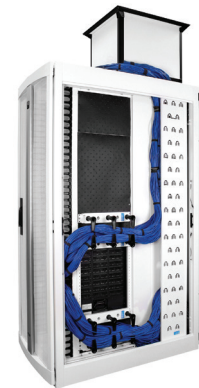
Complete airflow isolation for high-density network and storage switches