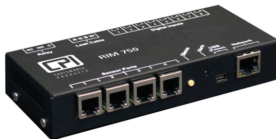
The RIM-750 system provides remote monitoring of environmental sensors for a single server cabinet or a small computer or telecom room.

> FOR MORE DETAILS VISIT ANIXTER.COM/SHOPCPI/APAC