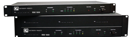
The RIM-1000 system provides remote monitoring of sensors and devices in your data centres and equipment rooms.