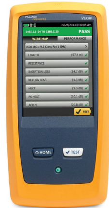
Graphically displays the source of failures for faster troubleshooting

Troubleshoot faults faster with the Taptive™ user interface that graphically displays the source of failures including crosstalk, return loss and shield faults.