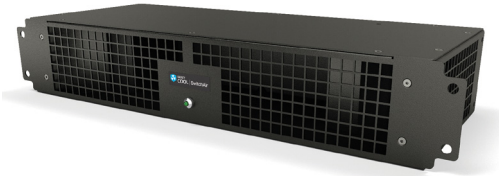
Prevent overheating of network switches by directing cool air to switch intakes, keeping hot exhaust air out.

To solve the problem, Geist has developed a passive SwitchAir unit that creates a barrier to effectively prevent hot exhaust air from entering switch intakes. Additionally, the Active SwitchAir model incorporates fans into the solution to supply cooled air from the cold aisle directly to switch intakes. Whatever the configuration, Geist can help keep your switches cool.