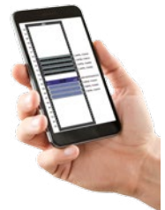
Manage from a smartphone

> FOR MORE DETAILS VISIT ANIXTER.COM/SHOPLEVITON