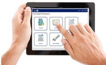
Manage from a tablet