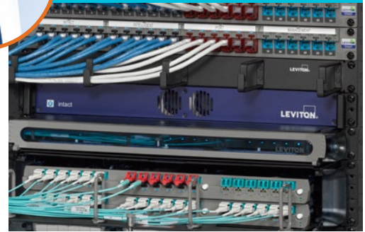
Identify and diagnose problems faster, reducing downtime and risk of human error.

Leviton's Intact Intelligent Port Management System makes it easy to monitor port status and manage network changes. Combining intelligent patch cords and panels, it sends real-time information to IT managers, so they can diagnose problems and handle changes faster.