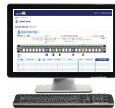
Manage from a desktop