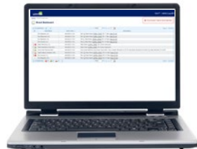
Manage from a laptop