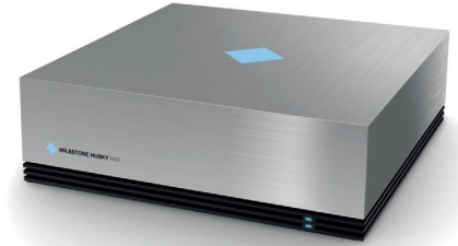
The Milestone Husky M30 is a stand-alone NVR that combines a powerful, purpose-built recording platform with the world’s leading video management software, XProtect®.