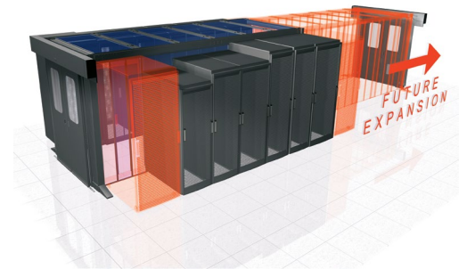
Flexibility to build a containment system and then add cabinets as needs dictate

Panduit's Net-Contain Universal Aisle Containment System allows users to reclaim underutilised cooling capacity and reduce energy and operational expenses by retrofitting their existing data centre with a versatile containment system. The system includes an independent support structure, sliding doors, vertical blanking panels and roof structure.